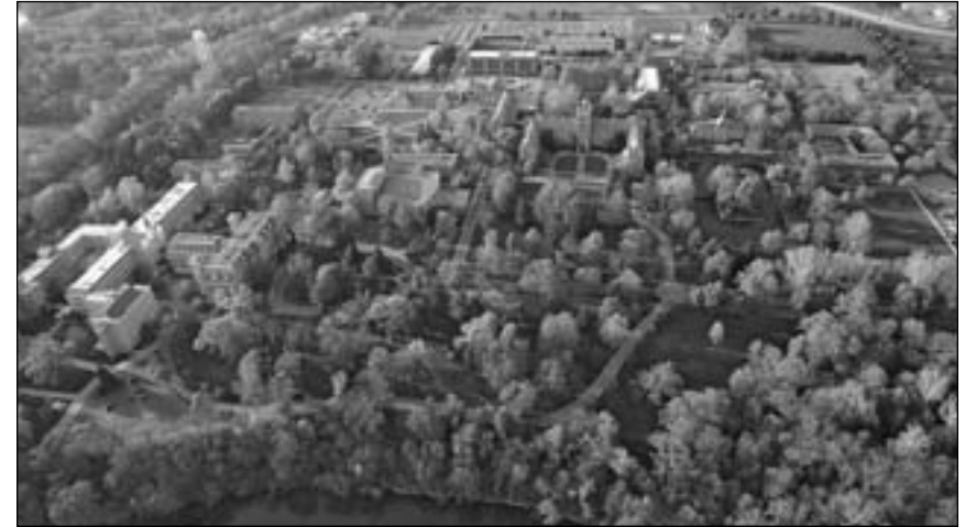
Saint Mary’s College Campus

The average 4 year graduation rate of the last 5 graduating cohorts is 73 percent. The average 6 year graduation rate of the last 5 graduating cohorts is 76 percent. The complete IPEDS Graduation Rate Survey may be found in the Office of Institutional Research.