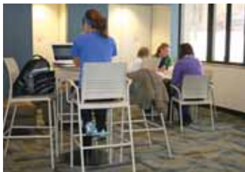
Madeleva Hall Renovations Page 19