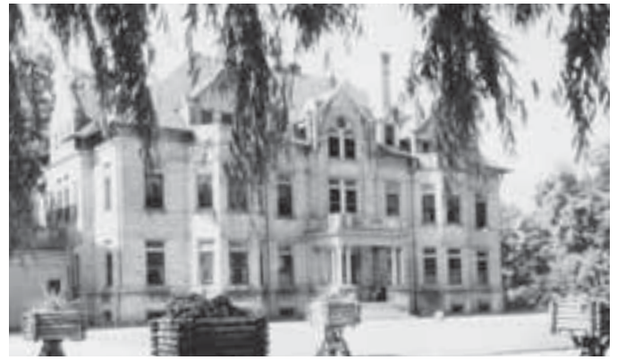
St. Joseph Hall, which housed the student infirmary, 1901

The Athletics Department contributes to student education and well-being in both tangible and intangible