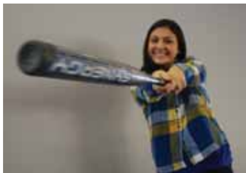
For the Love of the Game and Beyond Page 6