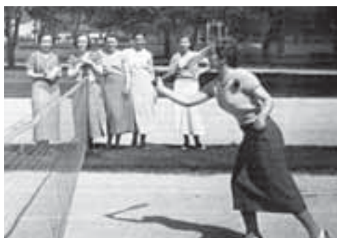
A Sporting Life Page 10