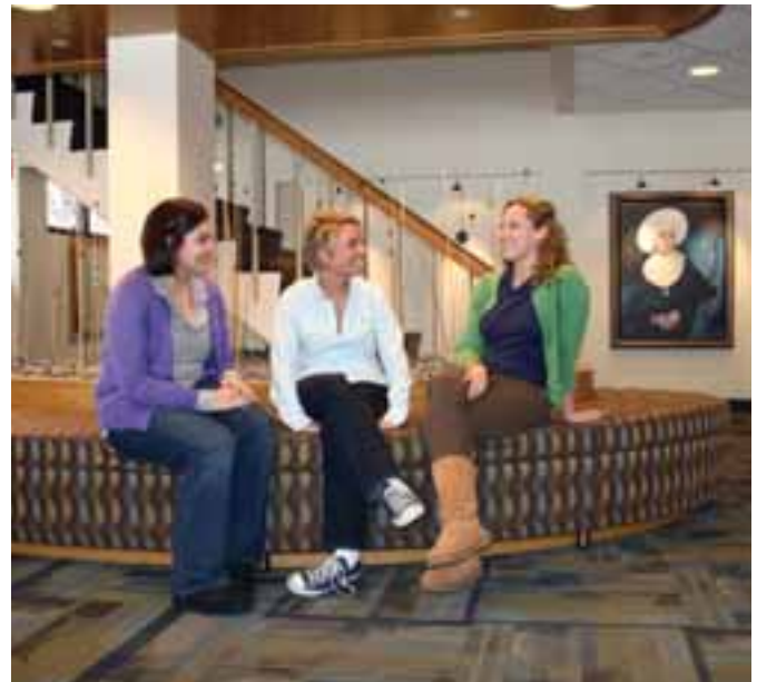
Students sit around the newly designed rock garden in renovated Madeleva Hall.