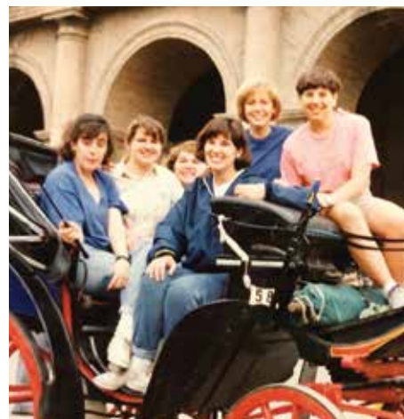
Studying abroad in Rome!